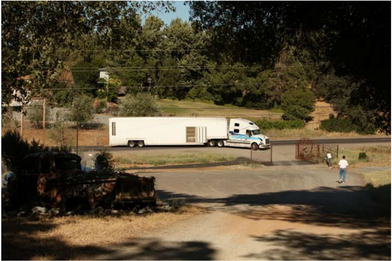
PRINCE HAS ARRIVED