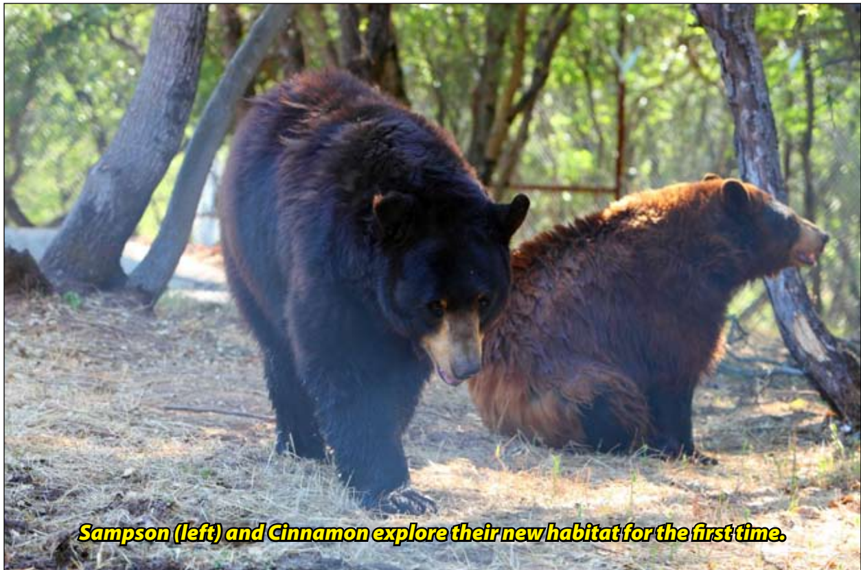
Sampson (left) and Cinnamon explore their new habitat for the first time.

Welcome home Sampson and Cinnamon, and thank you Bob Barker and the DJ&T Foundation!